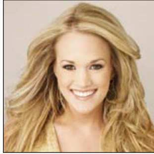
Carrie Underwood vocalist.

Carrie Underwood made history at the 44th annual Academy of Country Music Awards, as she became the seventh female in the organization's history to take home the coveted entertainer of the year trophy. Underwood joins exclusive ranks featuring Shania Twain, Barbara Mandrell, the Dixie Chicks, Loretta Lynn, Dolly Parton, and Reba McEntire, who each walked away with the award once. The vocal powerhouse also earned top female