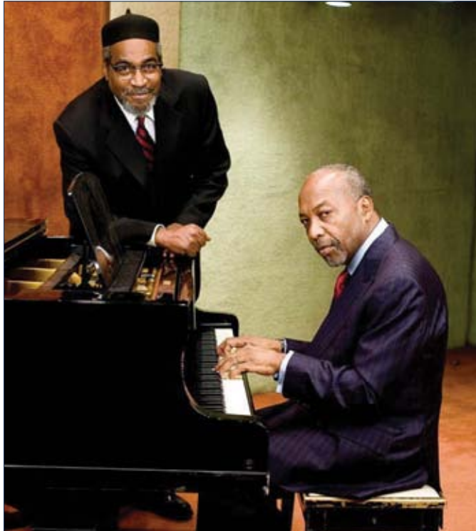
Kenneth Gamble and Leon Huff

and Huff composed and produced landmark work by their Philly International Records artists as well as others, including the O'Jays, Lou Rawls, Jerry Butler, Harold Melvin and the Blue Notes, Dusty Springfield, Wilson Pickett and many more. The pair has accumulated 22 gold and 8 platinum albums on